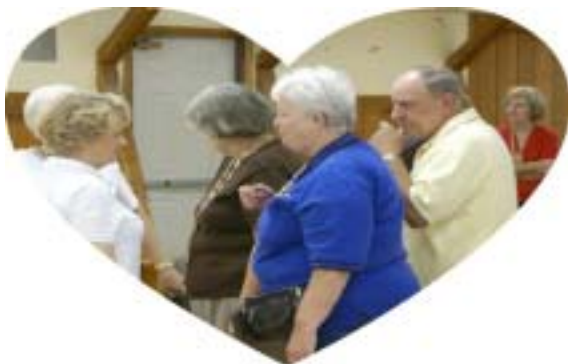
Above, parting “Good byes. To the right, serenity and quite as the sun sets is a memory that will last forever in our minds.