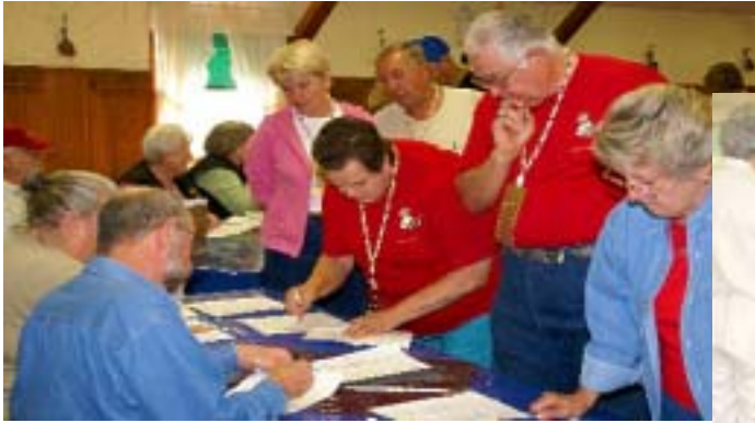
Registration line on Sunday afternoon.