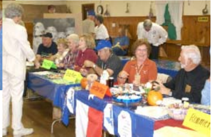
Chapter Row during a brief lull.